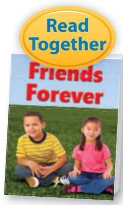
Friends Forever Genre: Poetry

Big Idea Everyone can be a good neighbor.