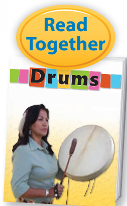
Drums Genre: Informational Text SOCIAL STUDIES